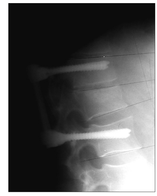
Figure 2. L1 fracture. Shaft reconstruction according to Daniaux

VBDR is the insertion of bone grafts through the base of the arch of the fractured vertebral body using a specialized tunnel. Holes with a diameter of 4–8mm were drilled at the bases of the arches of the fractured vertebral body. A curved mallet was inserted through the holes, and used to raise the deformed superior and lowered inferior wall of the vertebral body. Once the funnel was inserted, the spongy osseous tissue missing from the vertebral body was replaced with bone grafts.