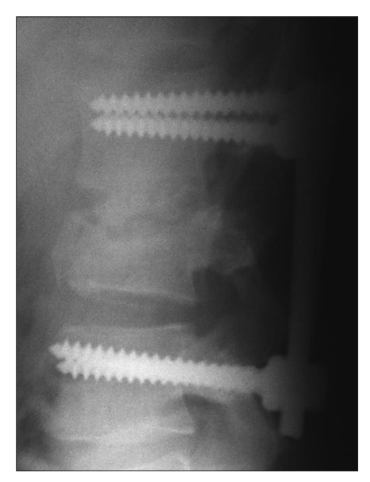
Figure 1. L2 fracture after surgery. PLIF reconstruction

PLIF was performed by using a specialized set of instruments. A metal sleeve was embedded into the space between the dural sac (which was moved aside), below the root of the spinal nerve and at the height of the intervertebral disc, through which two canals of 10mm diameter were drilled on either side of the spinal cord, reaching almost to the anterior longitudinal ligament. A small spoon was used to remove remaining fragments of the intervertebral disc and to scarify the endplate of the neighboring vertebral bodies. Bone grafts previously taken from the iliac crest were inserted into the space left by the removal of the intervertebral disc. PLIF was only performed on the superior level of the fractured vertebral body.